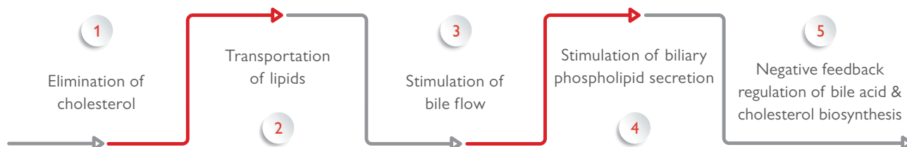
Figure 1: The five physiological functions of bile acids 3

Bile acids are water-soluble and amphipathic end products of cholesterol metabolism formed in the liver. Bile is stored in the gall bladder and released into the intestine when food is consumed. The fundamental role of bile acids is to aid in the digestion and absorption of fats and fat-soluble vitamins in the small intestine. In doing so, bile acids have five physiological functions within the body.